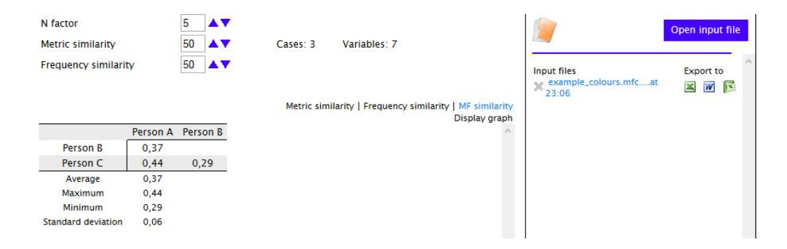
Figure 1: MF similarity between persons A, B and C in terms of color preferences (rated by preference).